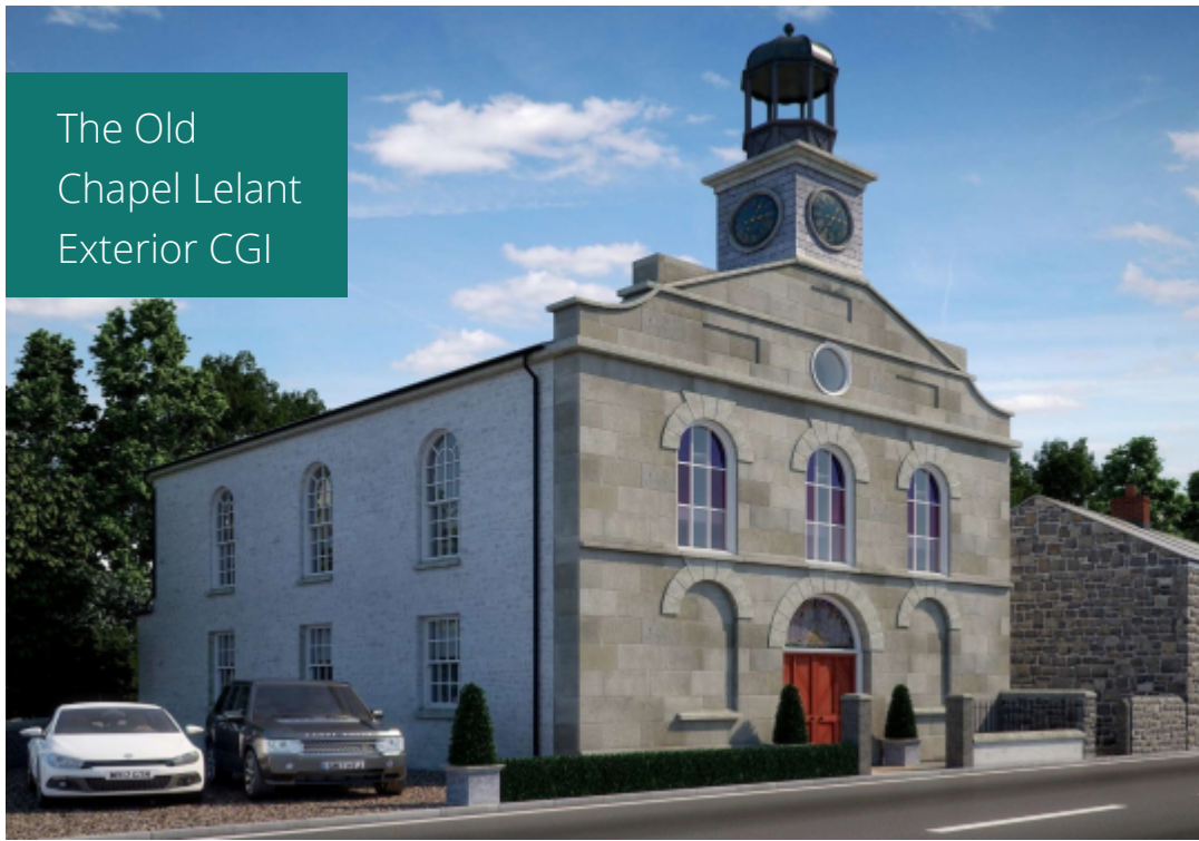
The Old Chapel Lelant Exterior CGI